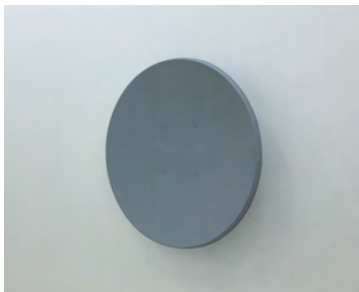
Sound Reflector 2017 Wall-mounted aluminium parabola, with reflected sound from UVB-76 100 x 110 x 25cm