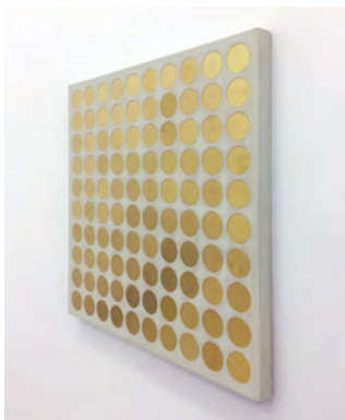
Cicadas, ball bearings and Synthesizer 2017 Piezoelectric elements, cement panel and audio player 62 x 62 x 3cm