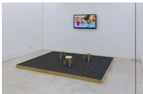
A conversation along the Highway of Brotherhood and Unity 2017 Wooden platform, carpet, 3 stools, audio transducers and player 245 x 200 x 45cm