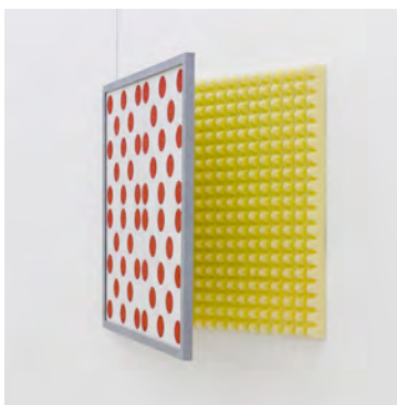
UVB-76, 2017 Printed electrostatic speaker, steel frame, foam and audio player 60 x 60 x 30cm