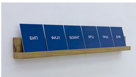
Noises (бука) 2017 6 Traffolyte engraved panels, wooden stand 17 x 100 x 12cm